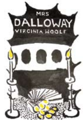
Vanessa Bell, Dust jacket design for Mrs. Dalloway, 1925. Collection of the Victoria University Library, Toronto.