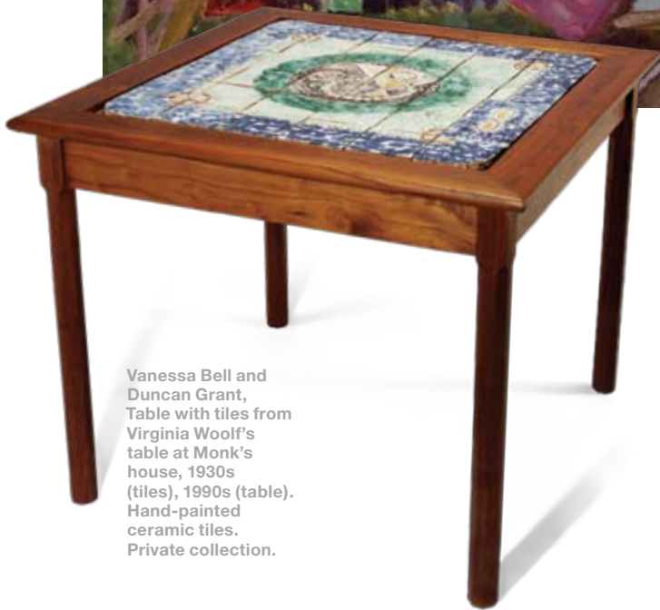
Vanessa Bell and Duncan Grant, Table with tiles from Virginia Woolf's table at Monk's house, 1930s (tiles), 1990s (table) . Hand-painted ceramic tiles. Private collection.