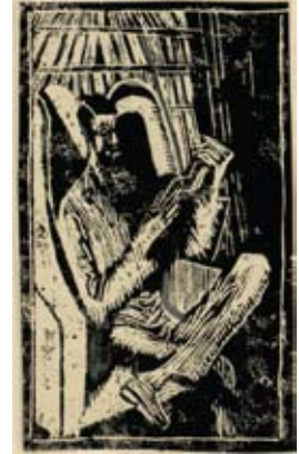
Dora Carrington, from Portfolio of Woodcuts for Bookplates, 1915-20. Collection of the Harry Ransom Humanities Research Center, University of Texas, Austin.