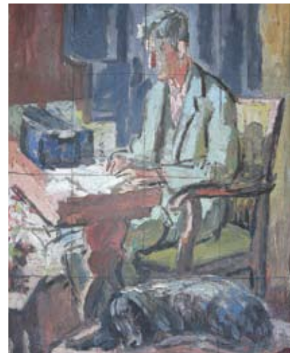
Vanessa Bell, Study for the Portrait of Leonard Woolf, 1938. Collection of the Victoria University Library, Toronto.