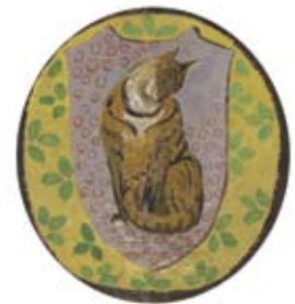
Vanessa Bell, Decorative design for Cat, 1930s. Private collection.